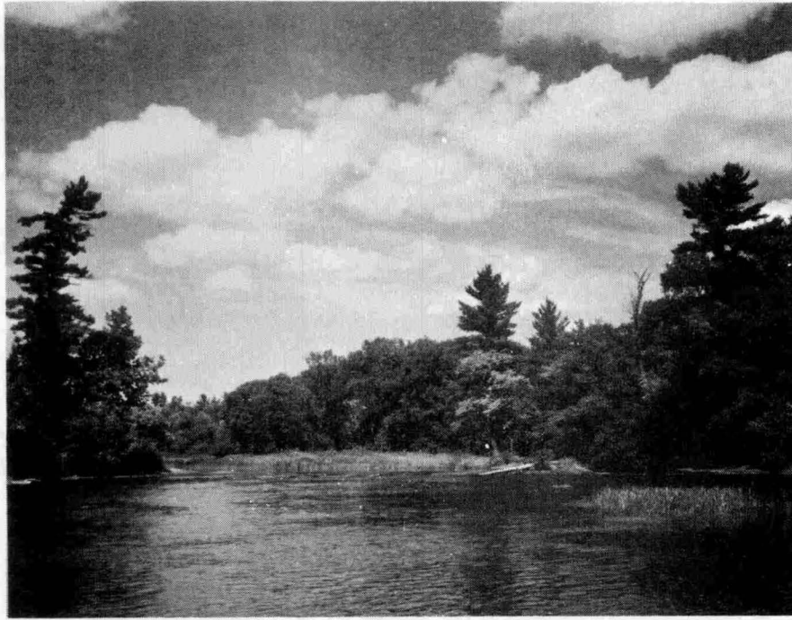
Photo 1 - A riffle in the Wolf River Study Unit