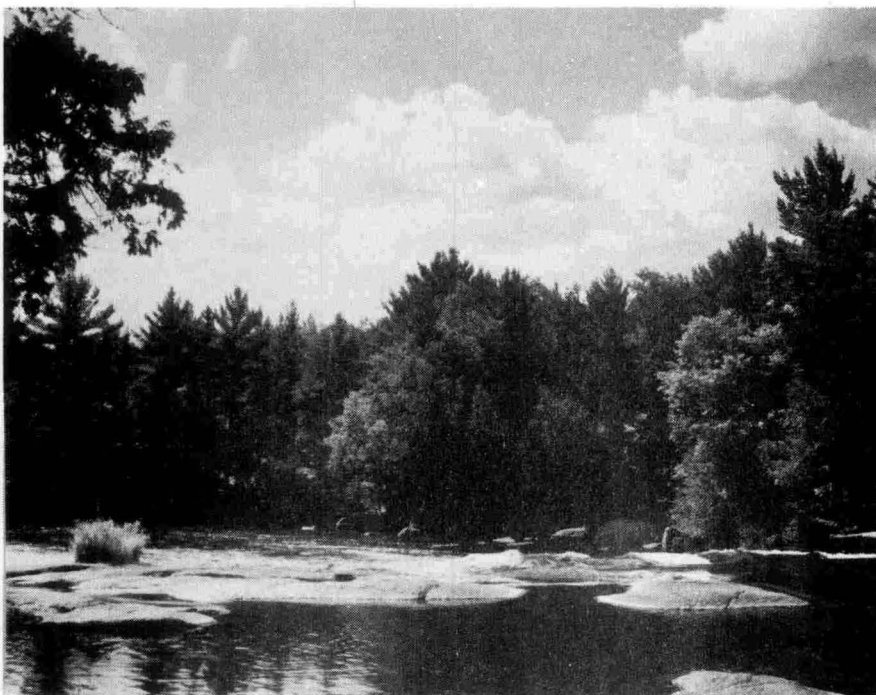
Photo 6 - Rock ledges are common