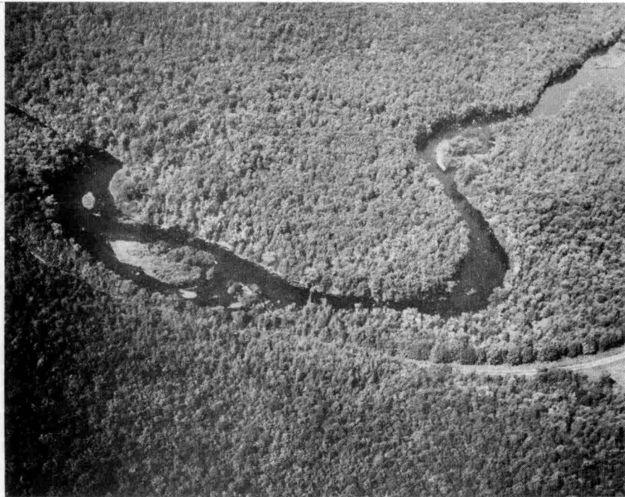
Photo 8 - The Wolf River in Menomonee County