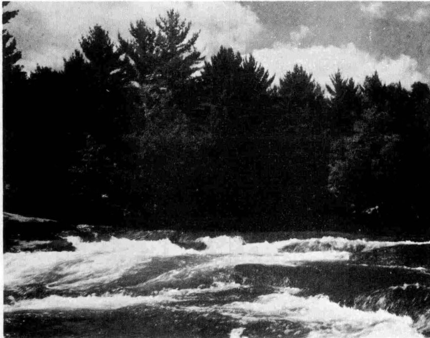
Photo 2 - Big Eddy Falls