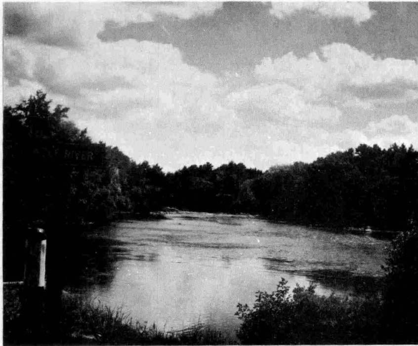
Photo 3 - Wolf River below Keshena