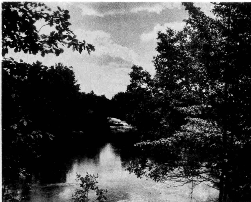
Photo 4 - Smokey Falls