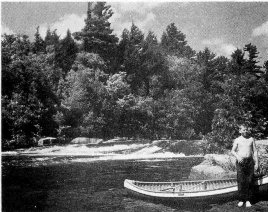
Photo 5 - Wolf River White Water